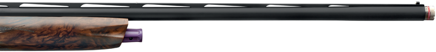
TRIWOOD™ ENHANCED TURKISH WALNUT STOCK