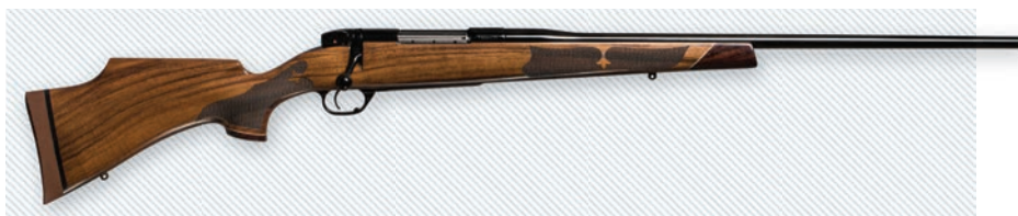
Weatherby Mark V Camilla Deluxe